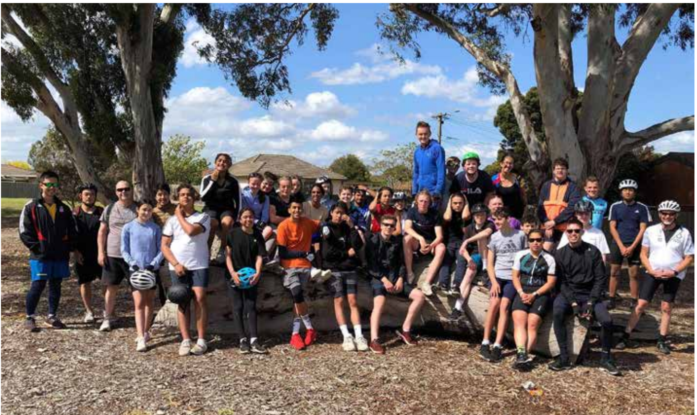
Year of Challenge